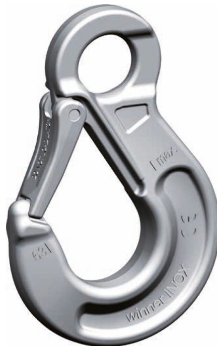
HSWI Eye sling hook

The manufacturing process is similar to EN 1677-2. The stamp and the CE-mark ensure that the product is clearly identifiable. The safety latch assembly is available as spare part SFGWI. Preferred areas of application are (sea-)water and wastewater applications and the product can also be used in connection with chemicals and food products; however, restrictions will apply.