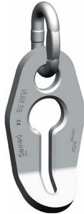
VLWI Chain shortener

Preferred areas of application for the VLWI shortener are water and wastewater applications and the product can also be used in connection with chemicals and food products; however, restrictions will apply and we recommend that you contact the manufacturer for advice prior to exposing the product to such use.