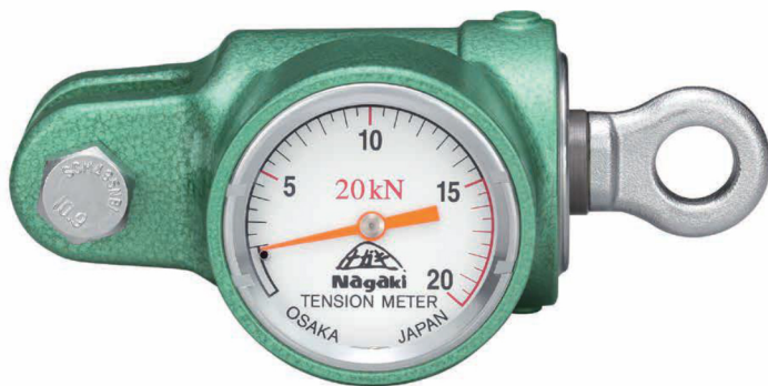
AS-20 (2.0TON) Item Code: 40104NS