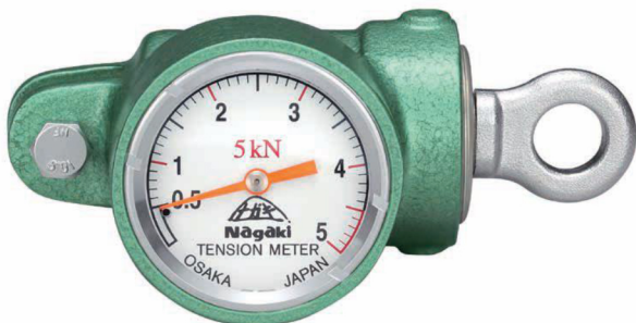
AS-5 (500kg) Item Code: 40102NS