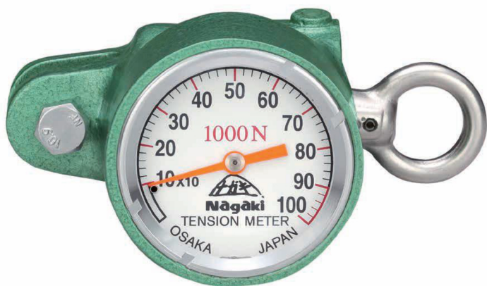
AS-1 (100kg) Item Code: 40101NS