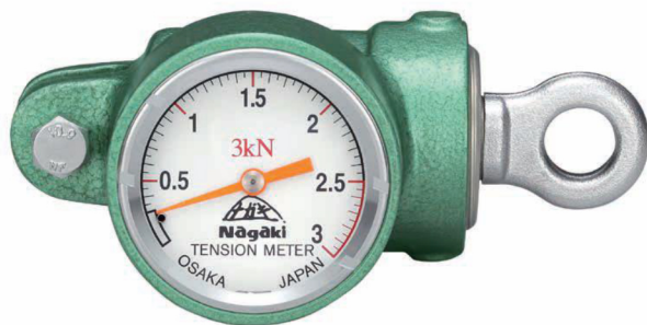
AS-3 (300kg) Item Code: 40108NS