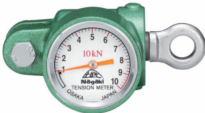
AS-10 (1.0TON) Item Code: 40103NS