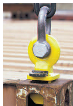
Container lifting lug CLT