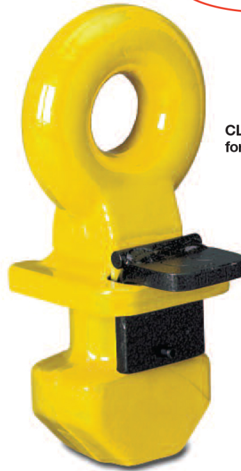
CLT for top lifting