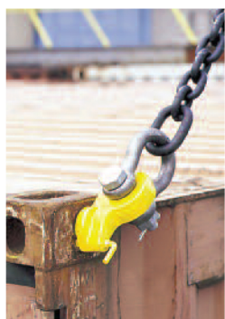
Container lifting lug CLB