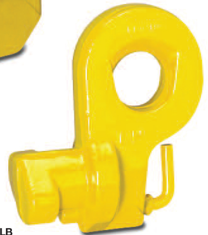
CLB for side lifting