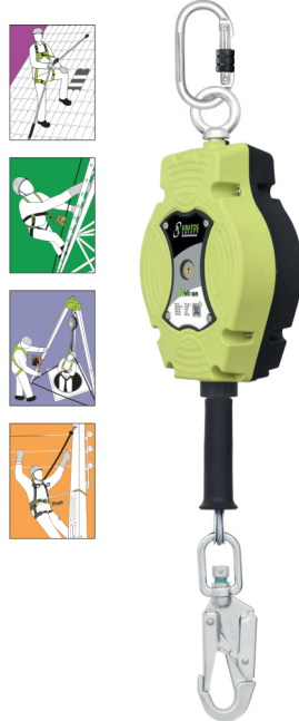
FA 20 402 10S INOX